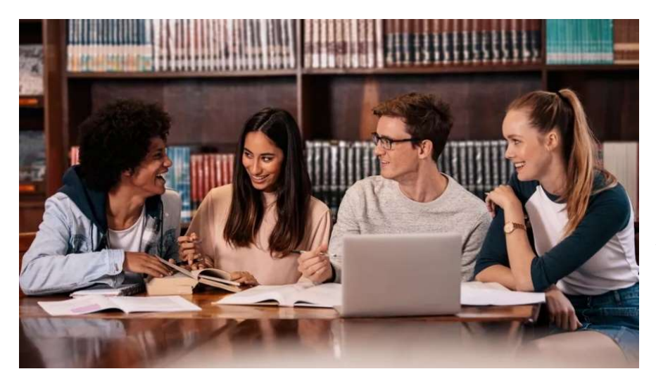
Joint online event on Tuesday, 16 November 2021, 10:00 - 12:45